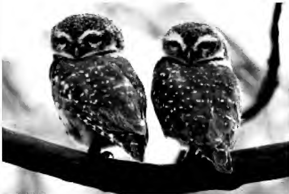
Spotted Owlet Athene brama These birds are largely nocturnal and crepuscular; they mostly use street lamps as hunting bases, hawking beetles and moths attracted to the light.